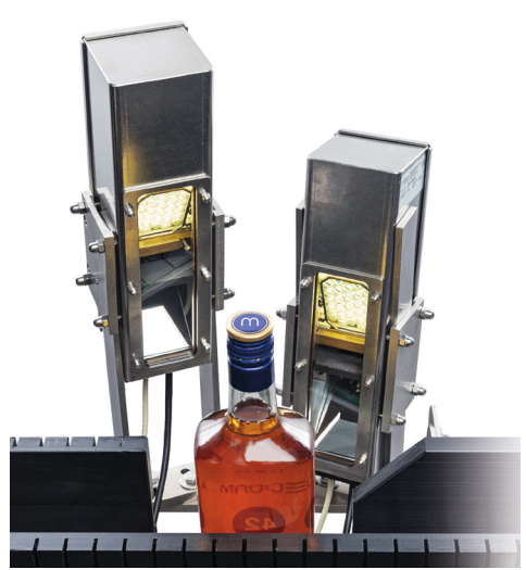
for integration into a labelling machine or in single file after the labeler. A prerequisite for use in single file, is that the labels are aligned with the camera module or that they are wrap-around labels

miho has developed an innovative camera based label inspection system