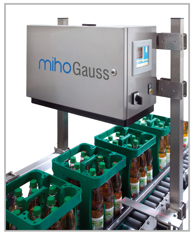
Full crate inspection unit miho Gauss F