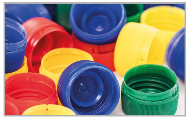
Inspection independent from the color of crates or caps