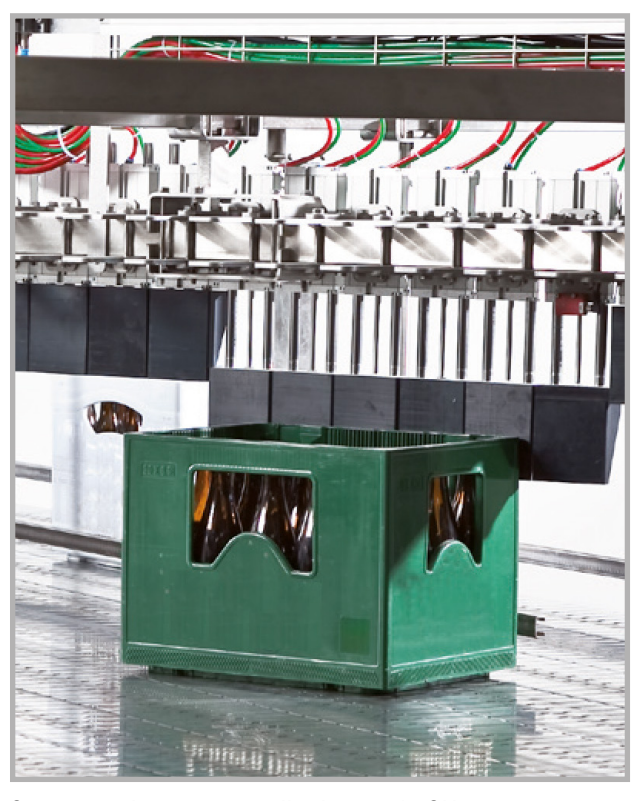
Segment reject system miho Leonardo SK