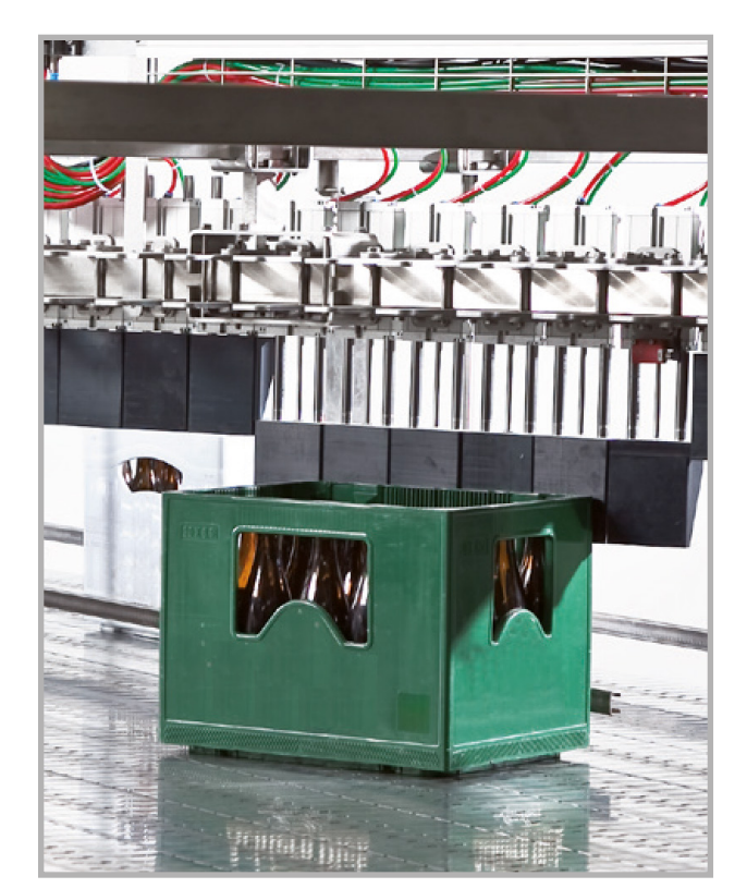
Segment-Ausleitsytem miho Leonardo SK