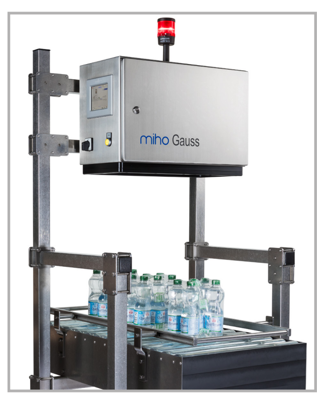
Packing inspection unit miho Gauss P