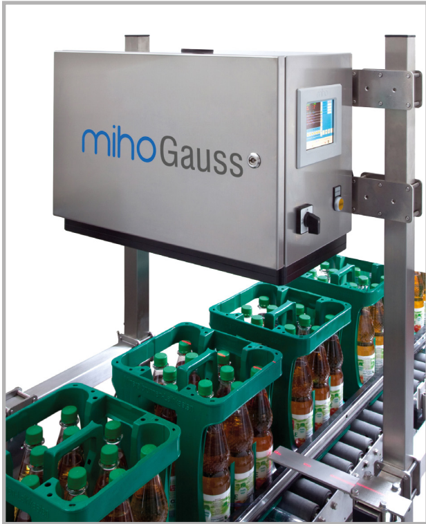
Full crate inspection unit miho Gauss F