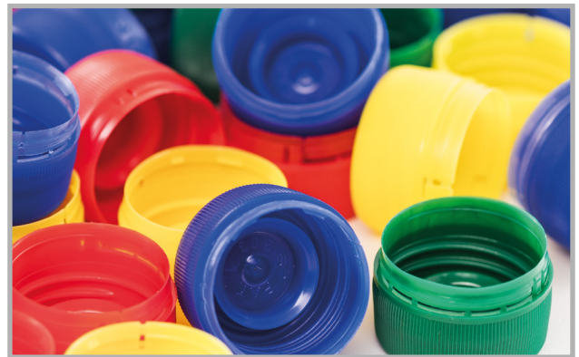
Inspection independent from the color of crates or caps