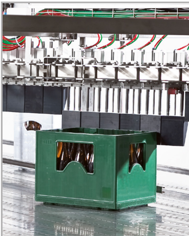
Segment reject system miho Leonardo SK